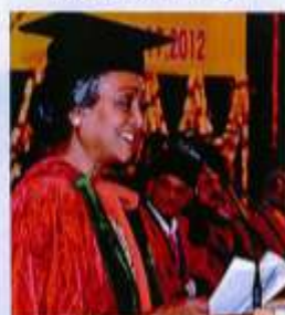
94 th Convocation – 2012 Hon'ble Speaker of Lok Sabha Smt. Meira Kumar