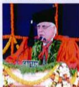
93 rd Convocation – 2011 Hon'ble Minister of HRD Shri Kapil Sibal