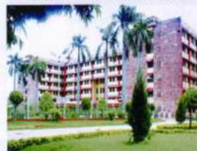
Sir Sunderlal Hospital