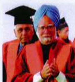
90 th Convocation – 2008 Hon'ble Prime Minister of India Dr. Manmohan Singh