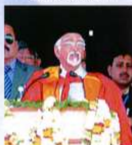
92 nd Convocation – 2010 Hon'ble Vice-President of India Shri Hamid Ansari