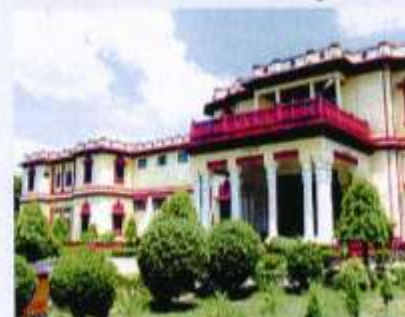
Bharat Kala Bhawan