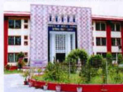
Institute of Medical Sciences