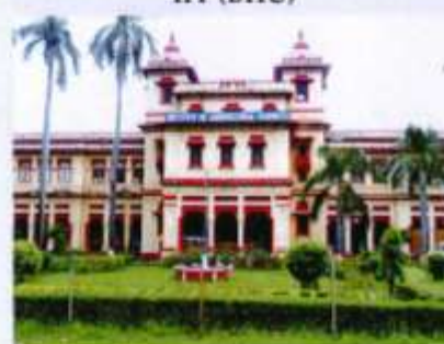
Institute of Agricultural Sciences