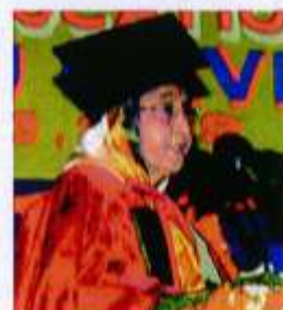
91 st Convocation – 2009 Hon'ble President of India Smt. Pratibha Devi Singh Patil