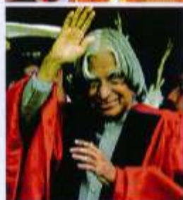
88 th Convocation – 2006 Hon'ble President of India Dr. APJ Abdul Kalam

Special Convocation – 2013 to commemorate the 150 th Birth Anniversary of Malaviyaji Hon'ble President of India Shri Pranab Mukherjee