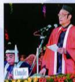
95 th Convocation – 2013 Hon'ble Chancellor of BHU Dr. Karan Singh