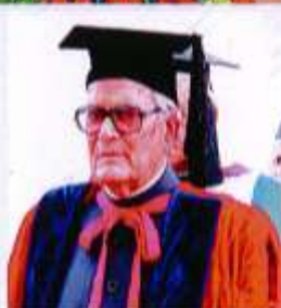
89 th Convocation – 2007 Hon'ble Vice-President of India Shri Bhairon Singh Shekhawat