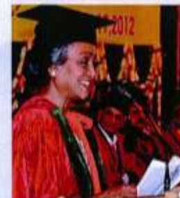
94 th Convocation – 2012 Hon'ble Speaker of Lok Sabha Smt. Meira Kumar