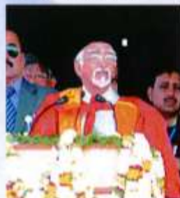
92 nd Convocation – 2010 Hon'ble Vice-President of India Shri Hamid Ansari