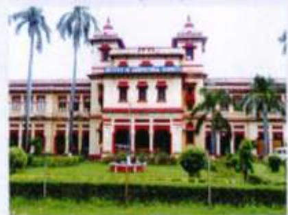
Institute of Agricultural Sciences