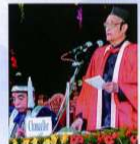
95 th Convocation – 2013 Hon'ble Chancellor of BHU Dr. Karan Singh