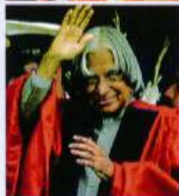
88 th Convocation – 2006 Hon'ble President of India Dr. APJ Abdul Kalam

to commemorate the 150 th Birth Anniversary of Malaviyaji Hon'ble President of India Shri Pranab Mukherjee