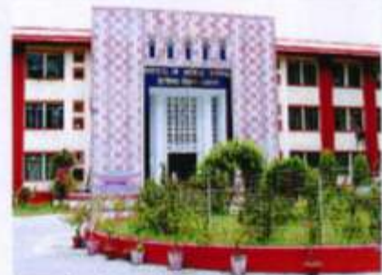
Institute of Medical Sciences