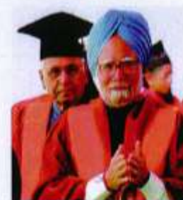
90 th Convocation – 2008 Hon'ble Prime Minister of India Dr. Manmohan Singh