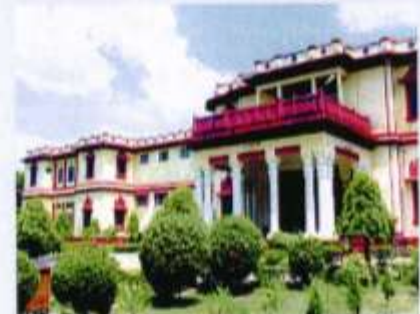
Bharat Kala Bhawan