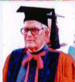
89 th Convocation – 2007 Hon'ble Vice-President of India Shri Bhairon Singh Shekhawat