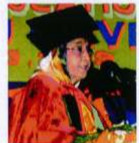
91 st Convocation – 2009 Hon'ble President of India Smt. Pratibha Devi Singh Patil