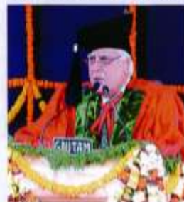
93 rd Convocation – 2011 Hon'ble Minister of HRD Shri Kapil Sibal