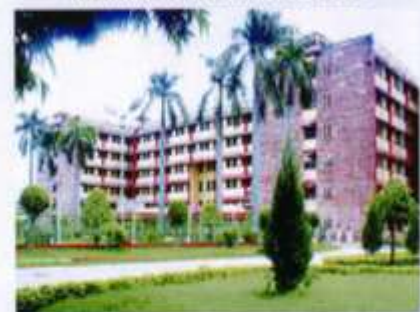
Sir Sunderlal Hospital