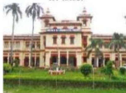
Institute of Agricultural Sciences