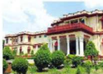
Bharat Kala Bhawan