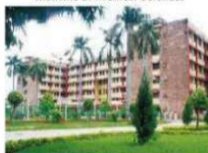
Sir Sunderlal Hospital