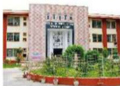
Institute of Medical Sciences